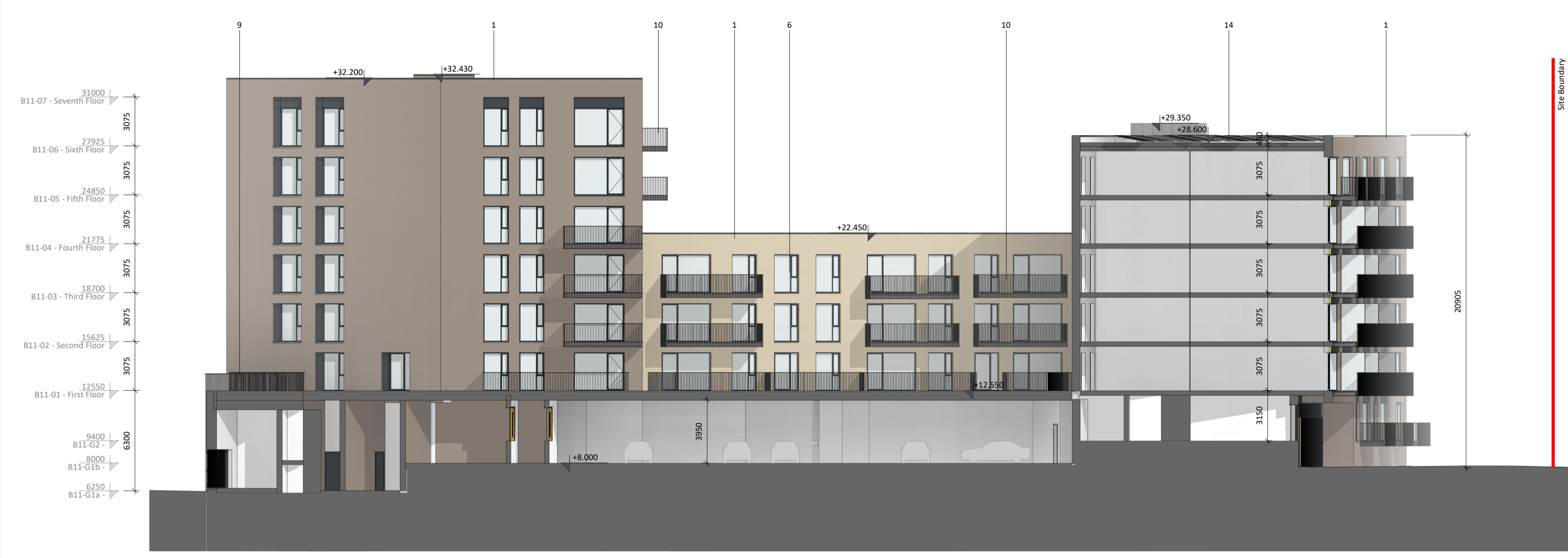
1 B11 Section A-A 1:200