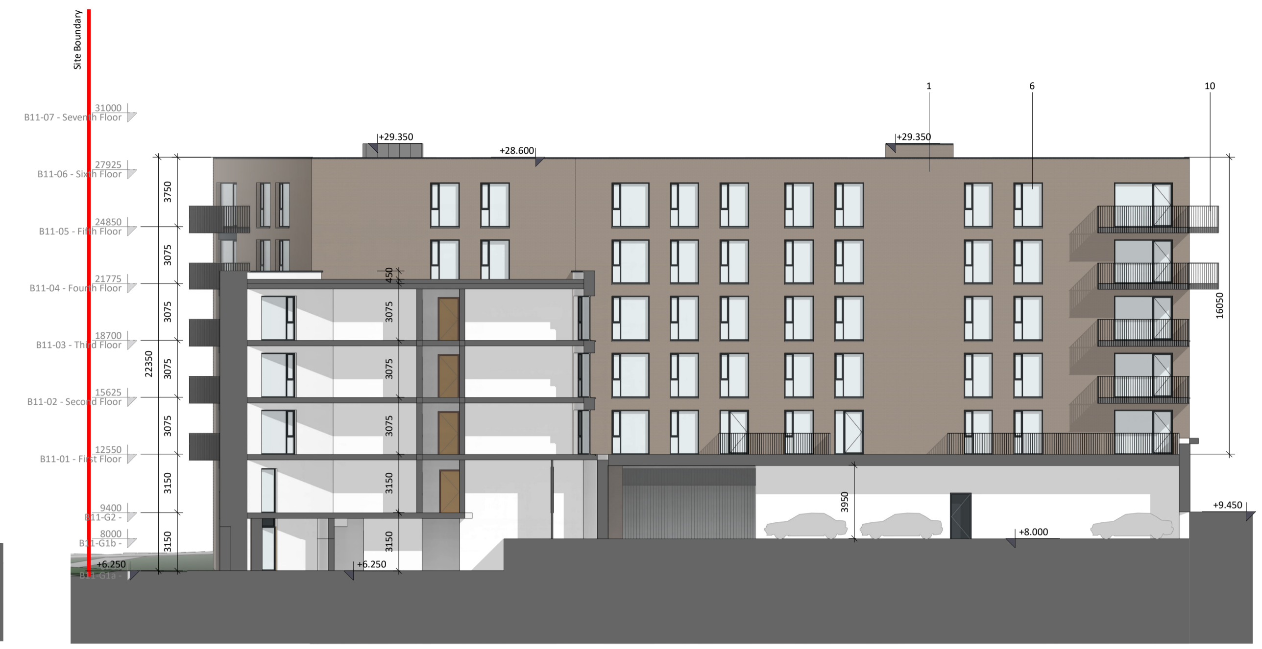
2 B11 Section B-B 1:200