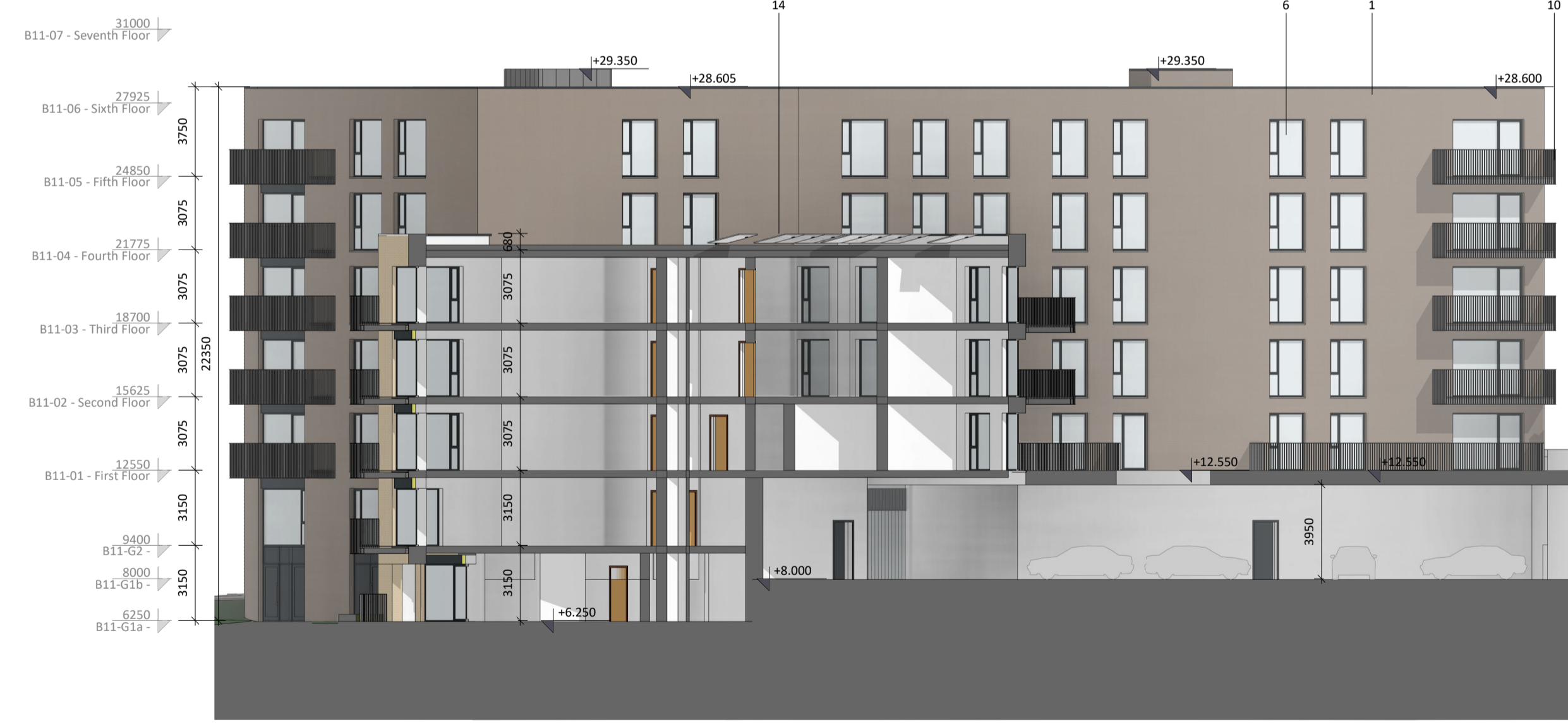
4 B11 Section D-D 1:200