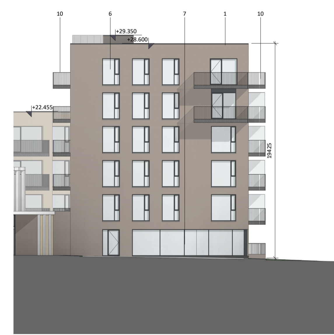
3 B11 Section C-C 1:200